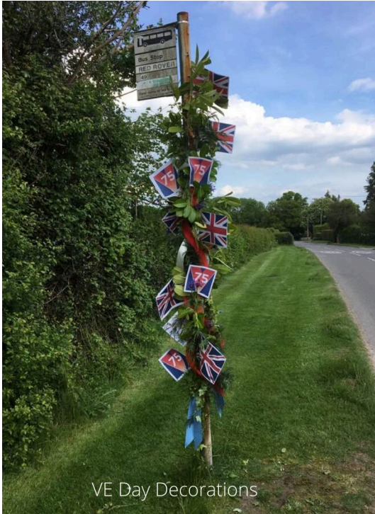
VE Day Decorations